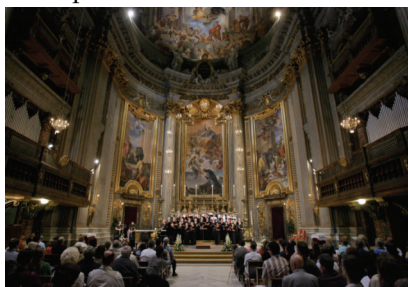
Overnight at hotel in Rome.

After breakfast, you will be transferred to St. Peter's Basilica to attend the Papal Mass (first Sunday of Advent) celebrated by His Holiness Pope Benedict XVI. Corpus Christi Church Choir will have special seating next to the Sistine Chapel Choir, and will be invited to sing the responses of the liturgy and possibly a communion hymn (subject to confirmation). After Mass, walk to St. Peter's Square to attend the noon Papal Blessing (subject to confirmation). Independent lunch.